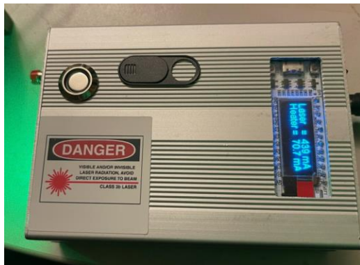
Fig.1. The PL530 Laser Source.