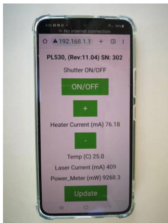
Fig.3. Remote Control via WiFi